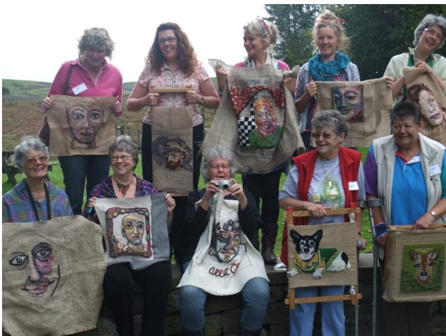
Left: Some of the students who attended the Reeth Rug Retreat in 2010 show off their work

Grinton Lodge's own licensed shop sells confectionery, wines and beers.